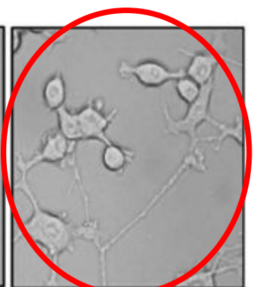
With MMF: Clearly visible Neurite Growth and Enhanced Structure